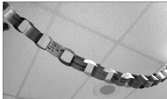
FIGURE 2. A Chain of Causes and Effects That Led to Hannah Baker's Suicide in Thirteen Reasons Why

pings of a man who went bankrupt after his business failed as a result of the gossip that emerged on a well-known website where people can post anonymously; screenshots of Web-based news coverage of an adolescent who committed suicide as a result of the cyberbullying he endured because of his sexual orientation; and research synopses of nationwide assessments of the effects of bullying